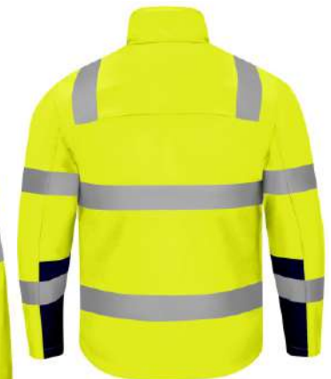
SAFETY JACKET Art# WASJ-1012