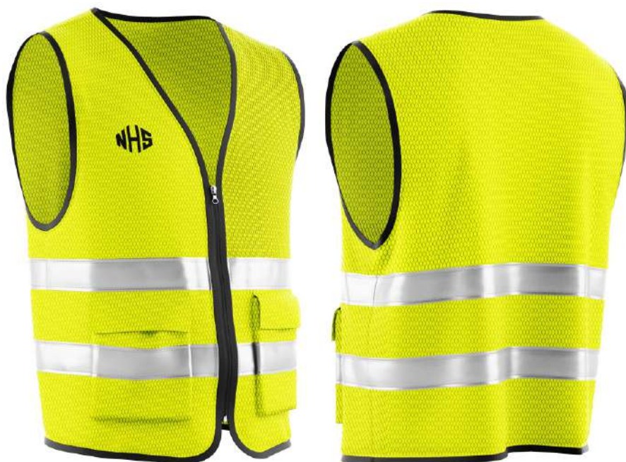
SAFETY VEST Art# WASV-1011