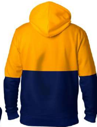
WORKING HOODIE Art# WAWH-1011