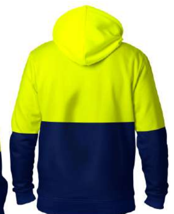
WORKING HOODIE Art# WAWH-1012