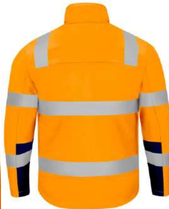
SAFETY JACKET Art# WASJ-1011