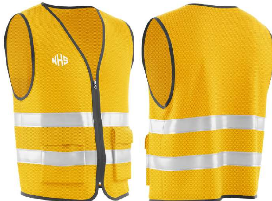
SAFETY VEST Art# WASV-1012